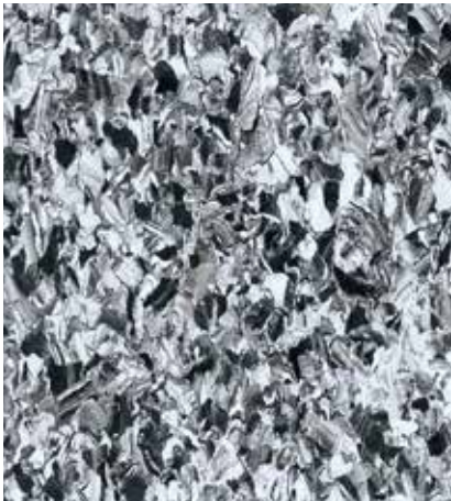
1618-601 Deep Sea