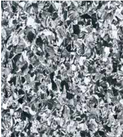
2618-601 Deep Sea