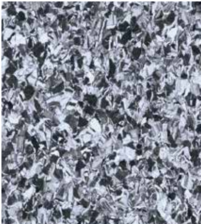
2618-602 Deep Sky